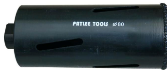
TCG Core Cutter Cup