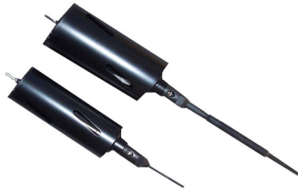
Long & Short Shanks