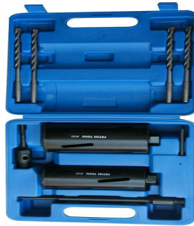
in Blow Mould Case