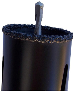
TCG Core Cutter